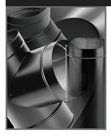
Single-wall interior stovepipe for connecting wood stoves to manufactured chimney